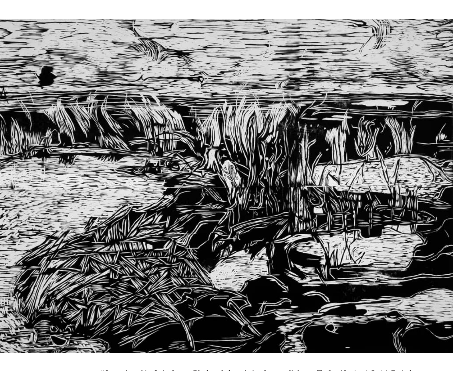
"Generation 4," by Gesine Janzen. Woodcut, 60 by 43 inches. Janzen will show at The Land Institute's Prairie Festival.