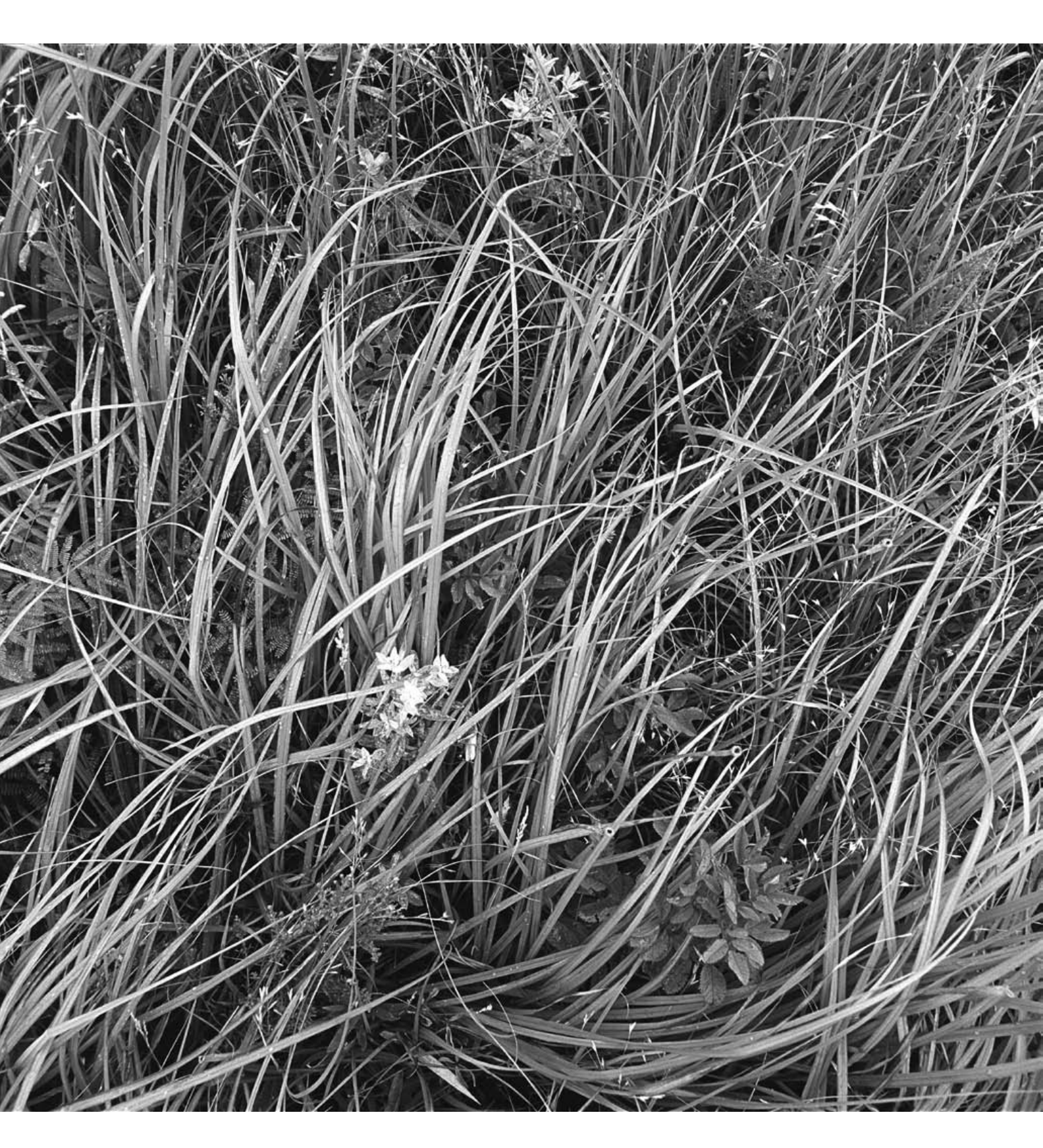
Fent's prairie, August 18, 1978, 9 to 11 am.