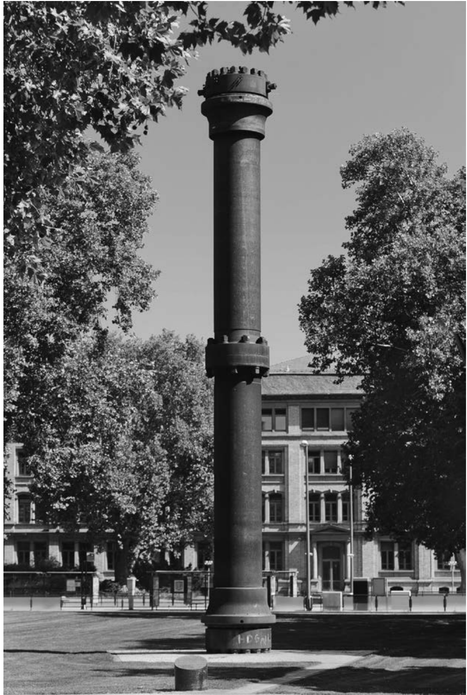
One of the first reactors for synthesizing ammonia now stands as a monument at the German company BASF. The synthesis makes feedstock for fertilizer that has multiplied both the human population and the kind of nitrogen that can alter ecosystems.