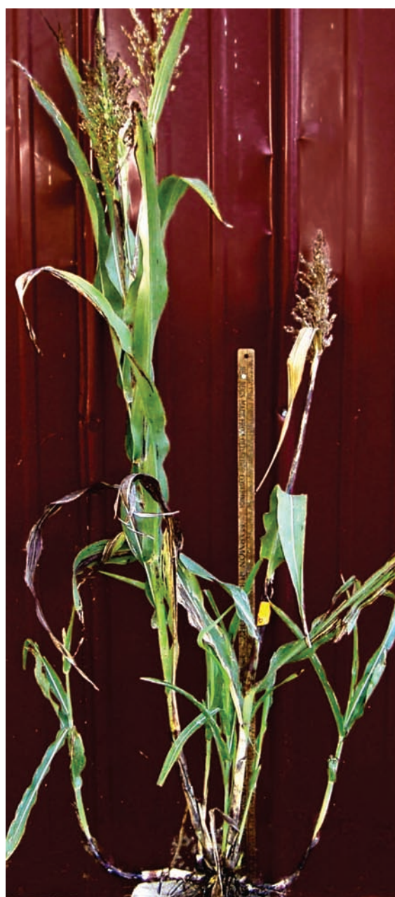
Figure 3. A relatively short sorghum plant with a relatively compact panicle (seed head) showing emergence of shoots from underground rhizomes in October 2005. This plant was excavated from a field experiment designed to evaluate families derived by self-pollination from hybrids between male-sterile grain sorghum and perennial sorghum. A meter stick is shown in the photograph. Fall emergence of rhizome shoots is not a desirable trait in itself, because such shoots will die with the first freeze. The ability to produce rhizomes is necessary for sorghum perenniality, however, and plants in which fall rhizome emergence is observed are more likely also to produce winter-hardy rhizomes that emerge the following spring. More than 300 plants in the population to which this plant belongs did emerge in spring 2006.

Even with expanded efforts, the road leading to perennial grains will be long, and it may often be rough; however, the time required should be put in context. Had large programs to breed perennial grains been initiated alongside the Green Revolution programs a half-century ago, farmers might well have had seed of perennial varieties in their hands today. As