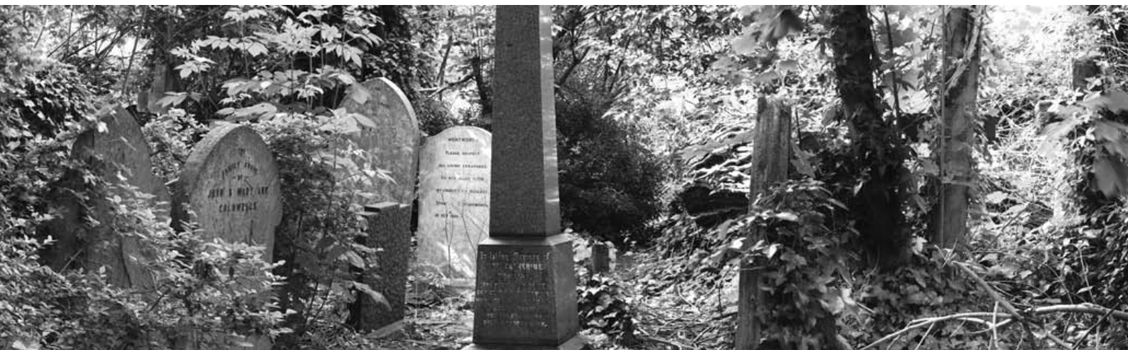
London's Abney Park was a garden cemetery in Charles Darwin's days. Now it is a nature reserve. Men set stones; plants and weather