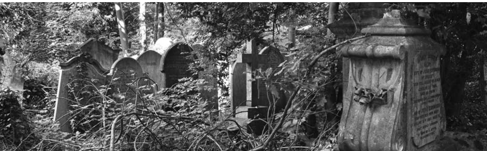
make with them soil and life.

Scientists as early as the late 1800’s suggested that cells held genetic material in complex compounds called nucleic acids, but the idea didn’t gain favor. Frederick Griffith steered back toward it in 1928 while working for the British health department with the germ that causes pneumonia. One