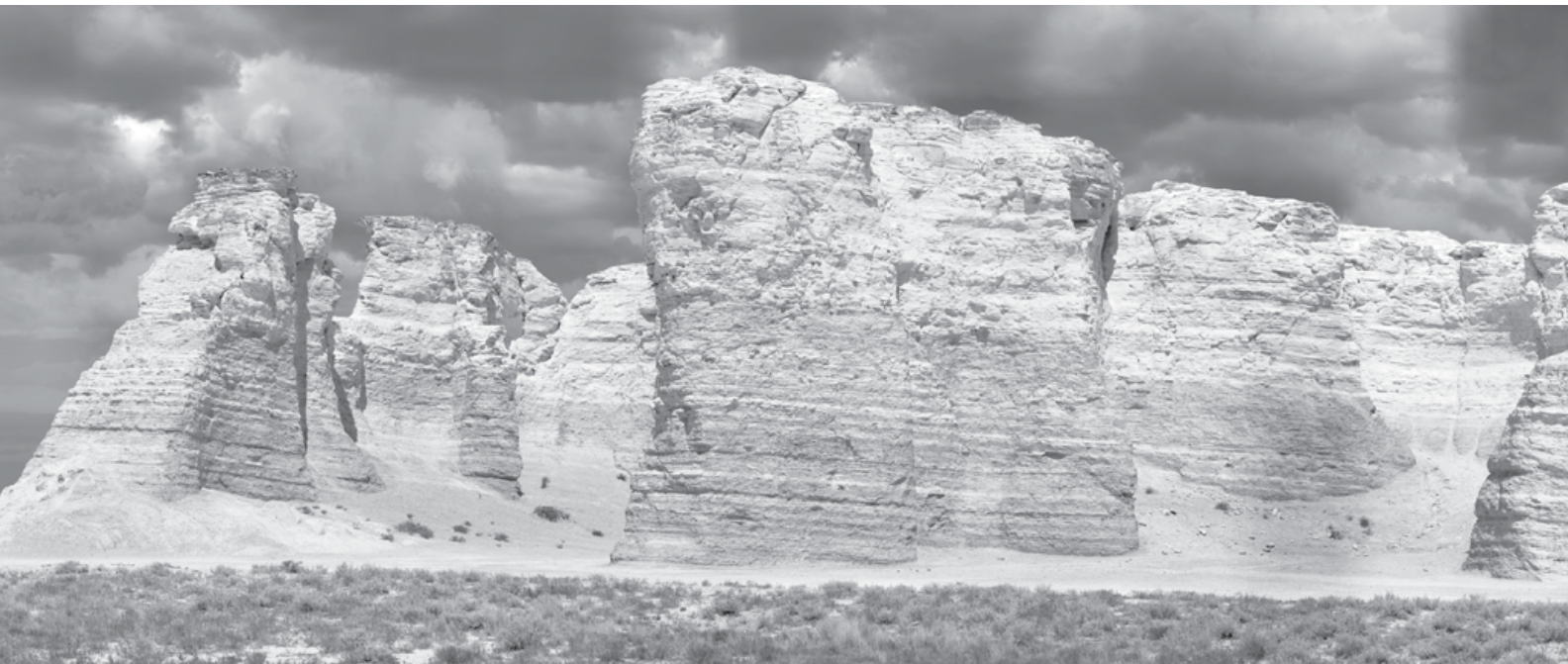
Fossils and crushed shells make Monument Rocks a chalky epitaph to Kansas as ocean millions of years ago. Similar layers in a cliff off

an organism passes on as set from the start. Darwin mostly went this way, but allowed for some trait acquisition by “pangenesis,” with cells throughout the body picking up hereditary material and sending it by blood to reproductive cells. A German named August Weismann would have none of this “soft inheritance.” He adopted an uncompromising selectionism, which came to be called neo-Darwinism. Weismann was first to advocate sexual recombination’s extraordinary power to create genetic variability for natural selection to act on – that this was the very purpose of sex. Biology also split into specific fields, distancing experimentalists, who looked into cells, and naturalists working with whole organisms.