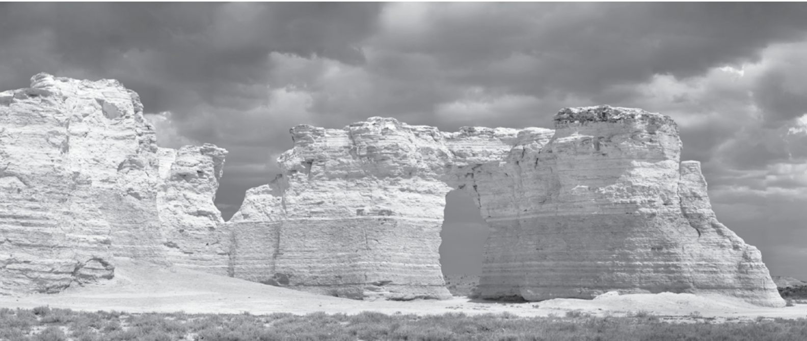
Africa helped Charles Darwin to see how life is a result of long evolution.

Swamped by such thinking about blended inheritance was an 1866 paper by a monk in Moravia. Gregor Mendel bred thousands of pea plants, to observe traits including height, seed shape, and flower color.