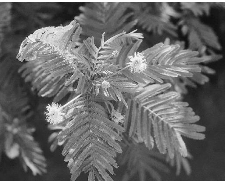
Scott Bontz. The blossoms of Illinois bundleflower are small and particular about when they will pollinate. We are testing how to best control pollination so this wild, perennial legume with high seed yield can be bred for agriculture.

other collections, we will take a big step in bundleflower's domestication.