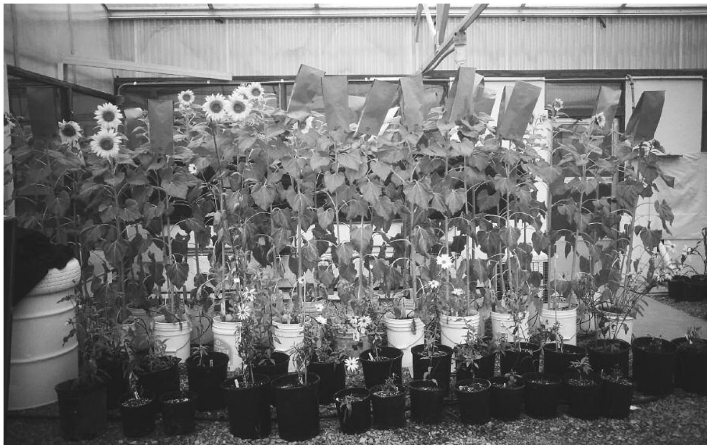
Scott Bontz. Sunflowers of different species and seed characteristics, assembled in our greenhouse. The bags are for controlling how the plants pollinate and what results. We're aiming for a sunflower with many big seeds and plants that live for years.

Silphium laciniatum , compassplant, caught our attention several years ago because it has large seeds and taproots that can go 15 or more feet deep. The recent discovery of a mutant with more fertile florets makes a grain-yielding Silphium more promising. We and our collaborators collected Silphium from 70 locations, mostly in Kansas but several in Texas. We sowed them in an observation plot in fall 2002, and they appeared good this year. Seed from vigorous specimens will be evaluated in large-plot experiments by 2005, once seed supplies have been built up. In the meantime, we will begin to make crosses with the mutant and various Silphium species.