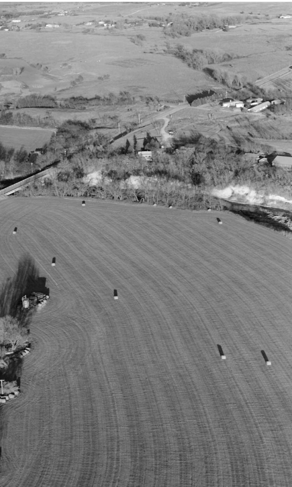
Terry Evans. A view of much of The Land Institute, looking northeast. The bottom half of the picture is the former Wauhob farm, now used for plant studies and breeding as well as farming. In the tight cluster of buildings at upper right is our office, greenhouse, workshop and storage shed. To the left of that is our 160 acres of prairie. Running through the scene is the Smoky Hill River and Water Well Road. We also have a 72-acre farm to the west. There we gradually devote more space to breeding plots as our plant gene pool grows. To the north is 208 acres for restoration and eventual study of our perennial crop plants in sloping ground, where they will be most valuable at controlling soil erosion.