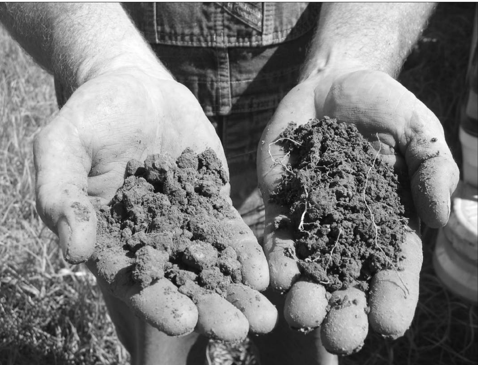
At left, cloddy soil from a field of wheat. At right, out of adjacent prairie, soil porous to air and water, rich crumb around perennial roots. Graduate fellows saw the same sort of contrast from adjacent plots of wheat and intermediate wheatgrass, a perennial plant we're both domesticating directly and breeding with wheat.

Critics say that perennials skimp on seed in favor