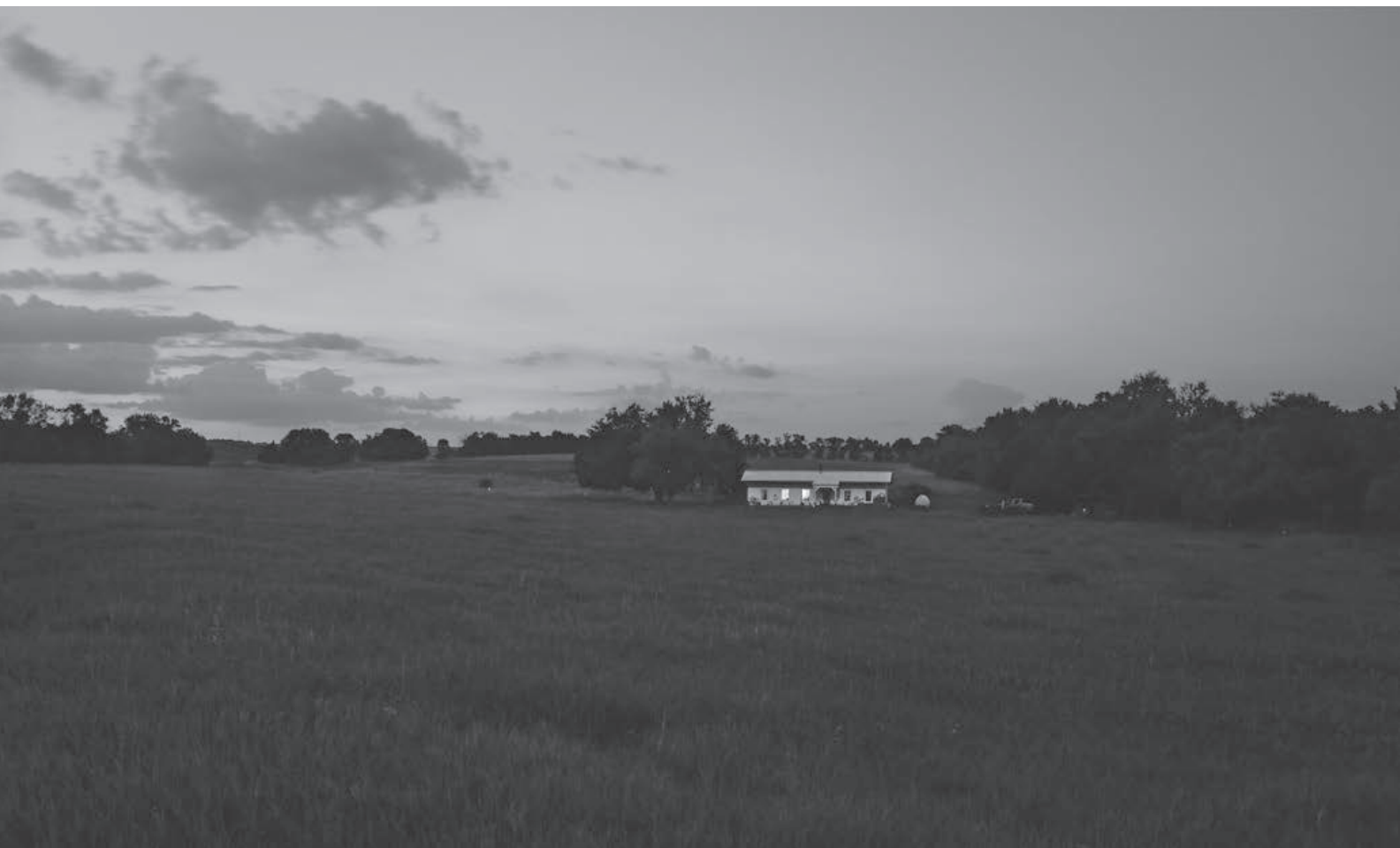
The writer and photographer's house at dusk, illuminated using 2 watts from a solar panel and battery.