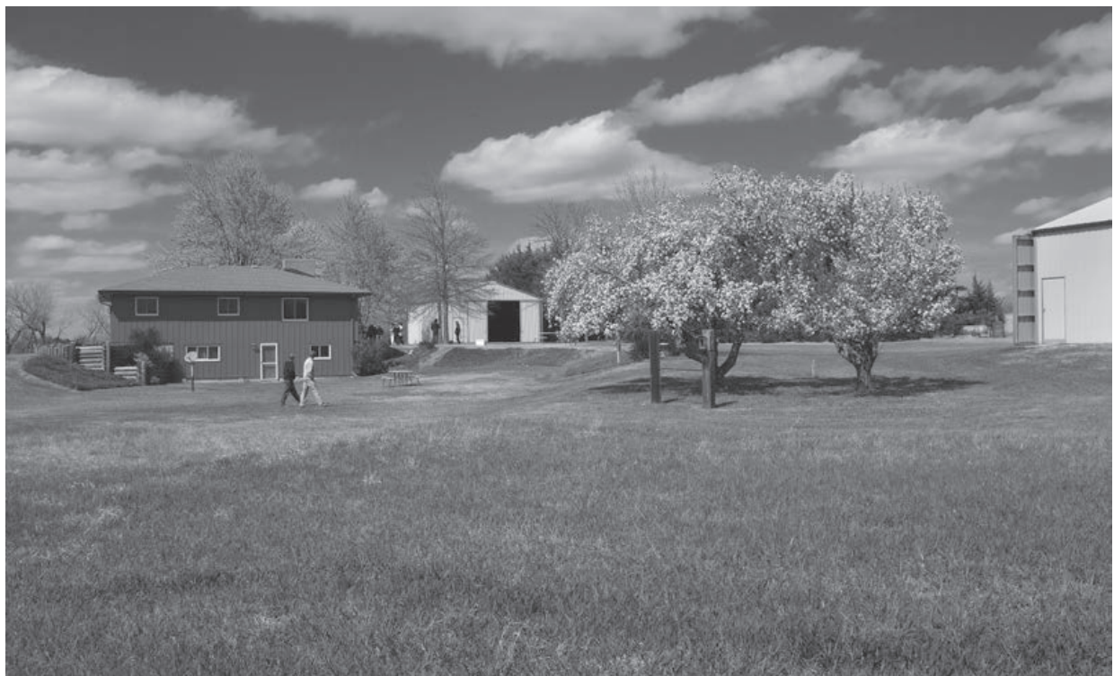
The Land Institute bought 31 acres, a house, and barns just east of its office and research buildings. See page 27.

Nonprofit organization US postage paid Permit No. 81 Salina, KS 67401