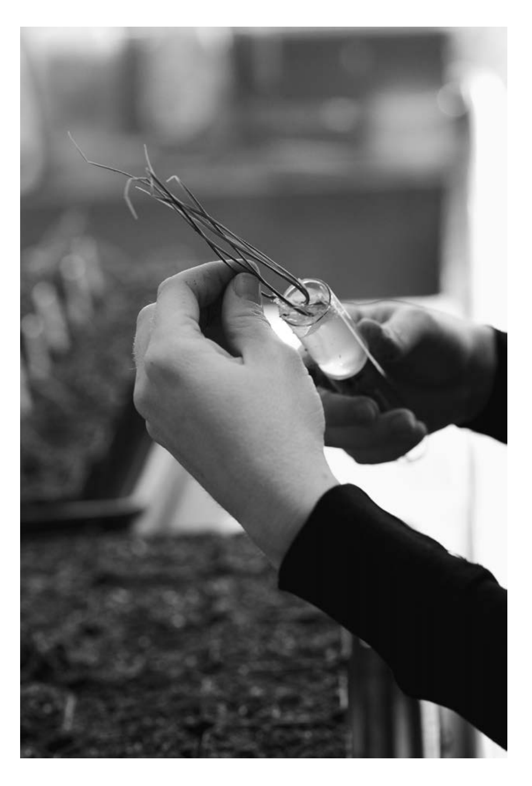
A hybrid perennial wheat seedling is removed from a test tube, where it had been grown from an embryo. Later generations of the hybrid will be more fertile, and breed without help.