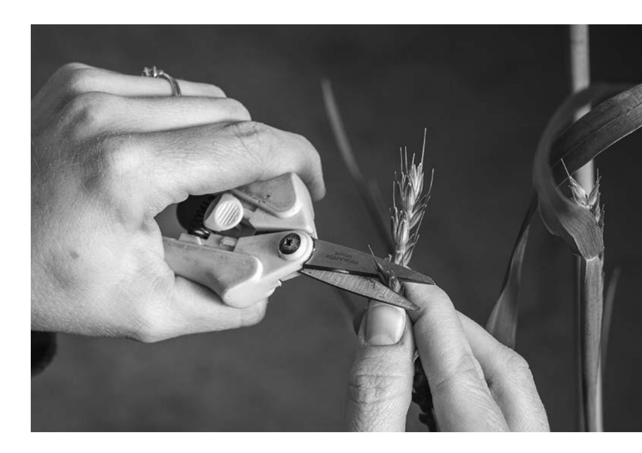
Cut the tops from each green floret of the wheat head, and with them goes the male stamen. Now pollen can be applied from a different, perennial plant, and combine traits from two species.

winter, it might be bred to beat the annual at making grain. If it yields less, the perennial's much lower demands for field work still might be a net gain for the farmer. Success of perennial wheat depends on more than yielding like a crop. It also must behave like one. A field of plants must flower and set seed in synchrony. Before harvest they must not go wild and drop their seed. After harvest, the seed must grind well and make good dough. Through all of the genetic sifting to get these traits, the plant must keep the genetic code that says: Buckle neither to Kansas winter nor to Kansas summer, but live instead like the prairie grass. Live so a