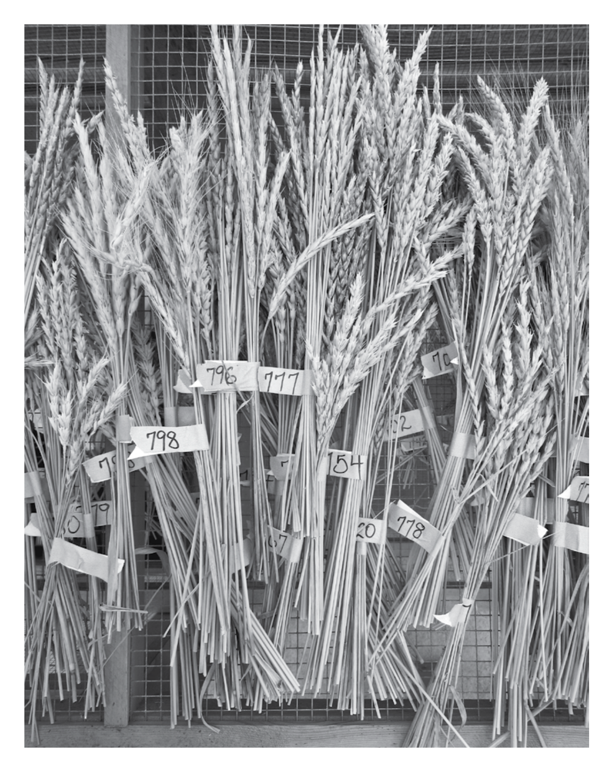
The Land Institute's breeding of annual crop wheat with perennial wheatgrass species makes for variety, and for the beginnings of a revolution in how to grow humanity's most important food.