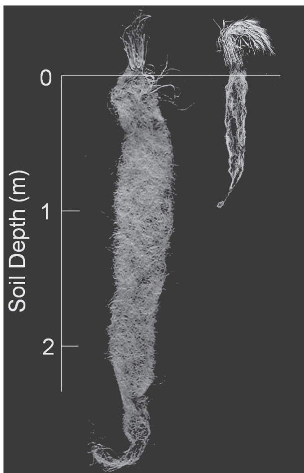
Figure 1. An illustration of the potential difference in root architecture between annual wheat and a perennial relative of domesticated wheat. The roots on the right are from the annual winter wheat cultivar Karl 92 and the roots on the left are from Thinopyrum intermedium . Plants were grown outdoors in 3 m long cylinders under similar growing conditions and excavated in late June.

effectively reduces disease severity 26–31 . In addition, such mixtures of genotypes may increase the durability of major gene resistance 31,32 . Since inoculum of Puccinia species (the rust pathogens) seldom overwinters in much of the Great Plains, conversion from annuals to perennials may not affect these diseases. However, because the survival structures (ascocarps) of powdery mildew fungi survive between crops in and on plant residue, long-term effects of pathogen persistence should be considered when managing powdery mildew under a perennial production system.