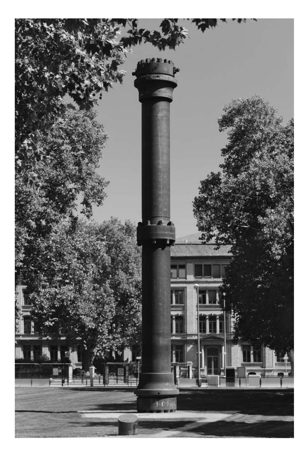
One of the first reactors for synthesizing ammonia now stands as a monument at the German company BASF. The synthesis makes feedstock for fertilizer that has multiplied both the human population and the kind of nitrogen that can alter ecosystems.