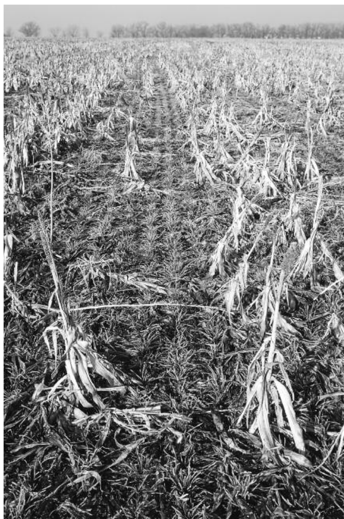
Scott Bontz. Wheat that was sown into milo stubble. Instead of spending many more hours of tillage to make the entire field a planting bed, dirt clumps and crop debris can be pushed aside and the seed dropped into all the space it needs.