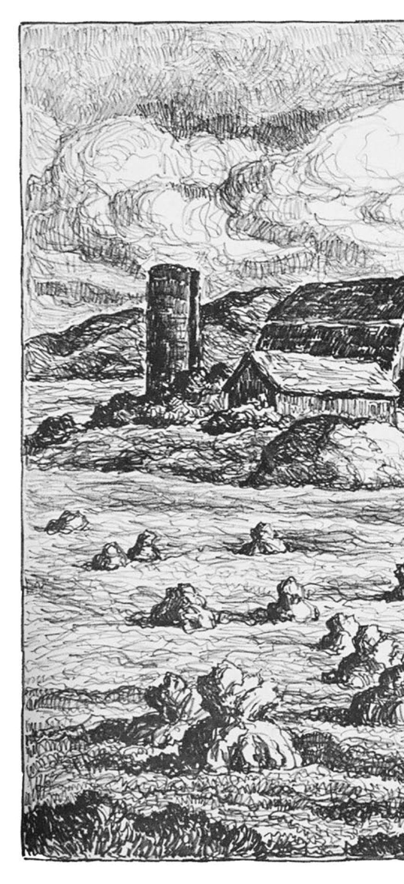
Kansas Wheatfarm, by Birger Sandzen. Lithograph, 20 by 15 inches,

What we are up against is that the important environmental trends are almost entirely negative. Human population size and consumption are beyond what Earth can durably support. Human industry has forced climate change—which has undone many local cultures that had impoverished their surroundings. Ninety percent of top ocean predators are gone. Half of the world's forests have been cut down. If current rates of erosion and fertility loss persist, most arable land will be gone in several