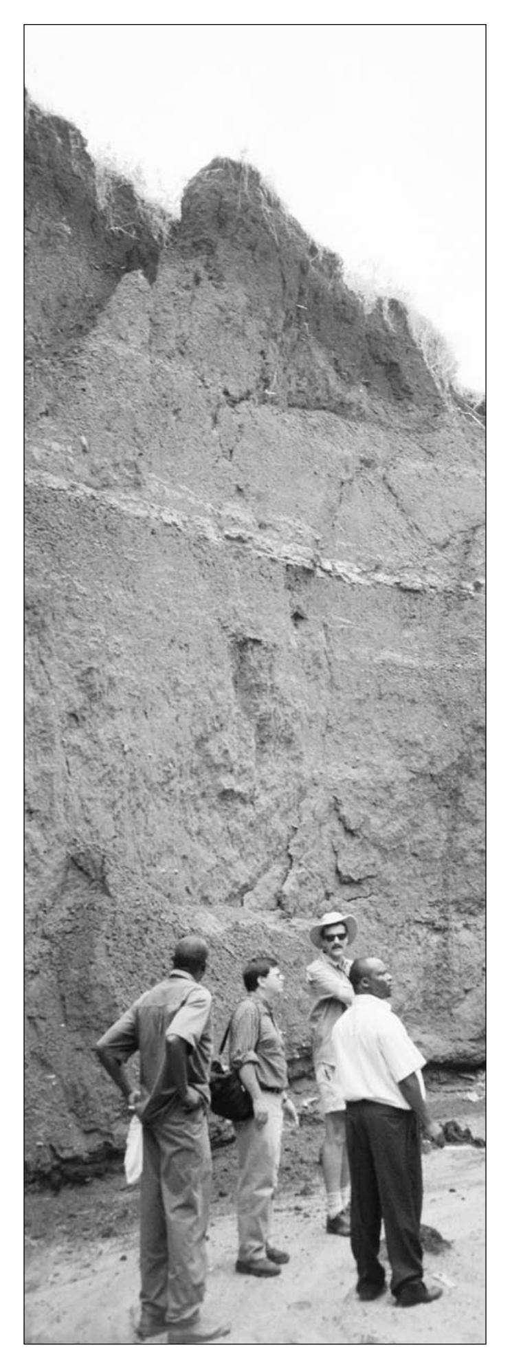
The Land Report 18