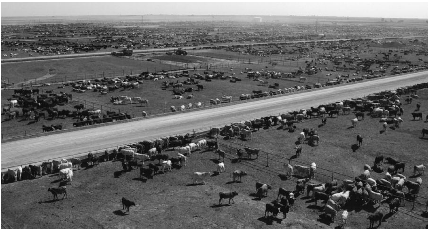
Where's the beef: Eating up land for carb-fed, calorie-wasting cattle to give us protein.

With all factors considered, diets emphasizing plant products are more likely to be ecologically sound for the