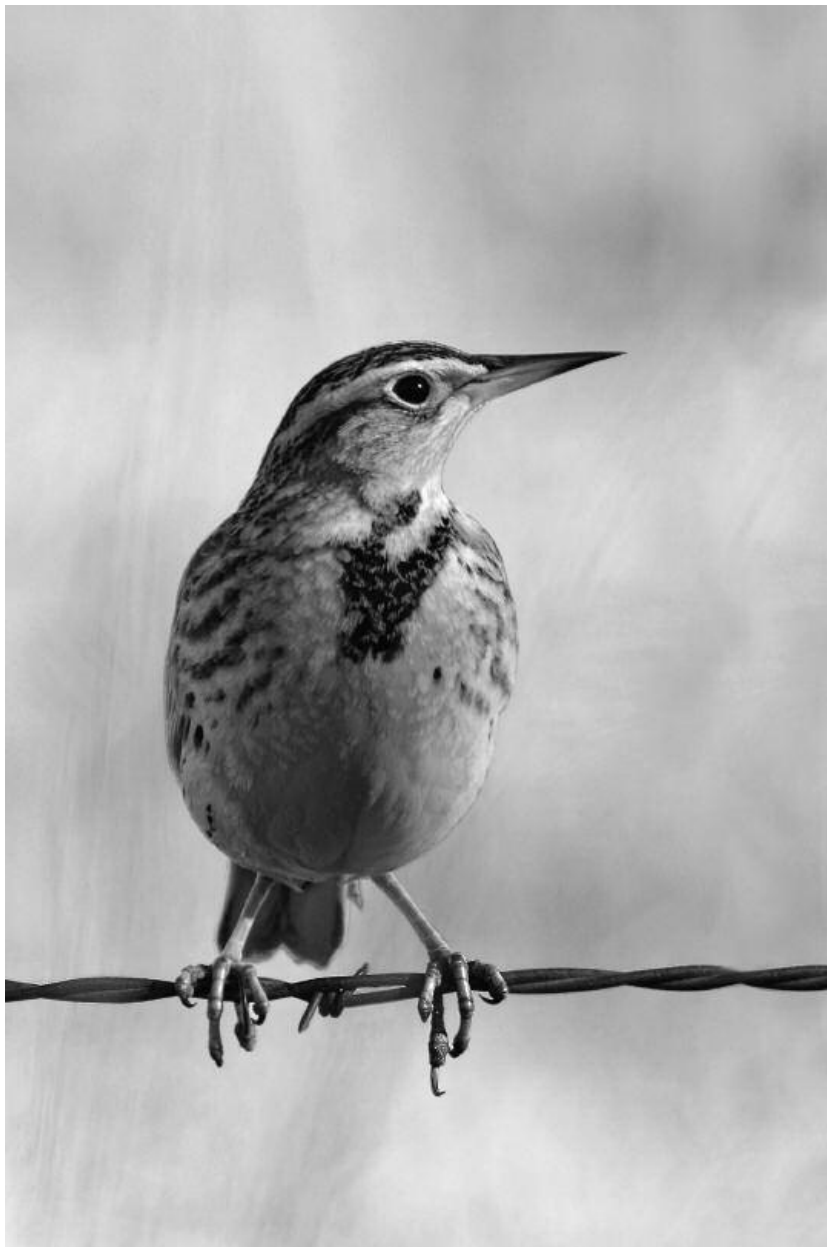
Judd Patterson. Western meadowlark.