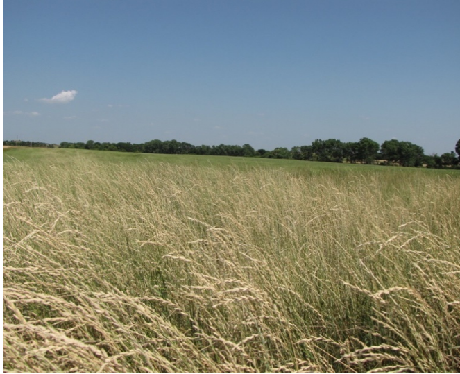
Kernza intermediate wheatgrass.