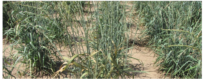
A first year stand of Kernza intermediate wheatgrass plants, widely spaced for research. The plant in the center shows signs of severe bacterial leaf streak infection. Adjacent plants are healthy, likely due to resistance to the disease.

Diseases. Kernza intermediate wheatgrass has not been grown long enough to show extensive disease concerns in the Upper Midwest. It is susceptible to some infection by most small grain diseases, although it is currently highly resistant to rusts , and other common and devastating grain diseases. Damage by bacterial leaf streak can be severe, causing near-complete defoliation. The disease is at its worst after periods of high temperatures and relative humidity. Bacterial leaf streak has not been found to damage grain yields so far but is expected to reduce forage yield and quality.