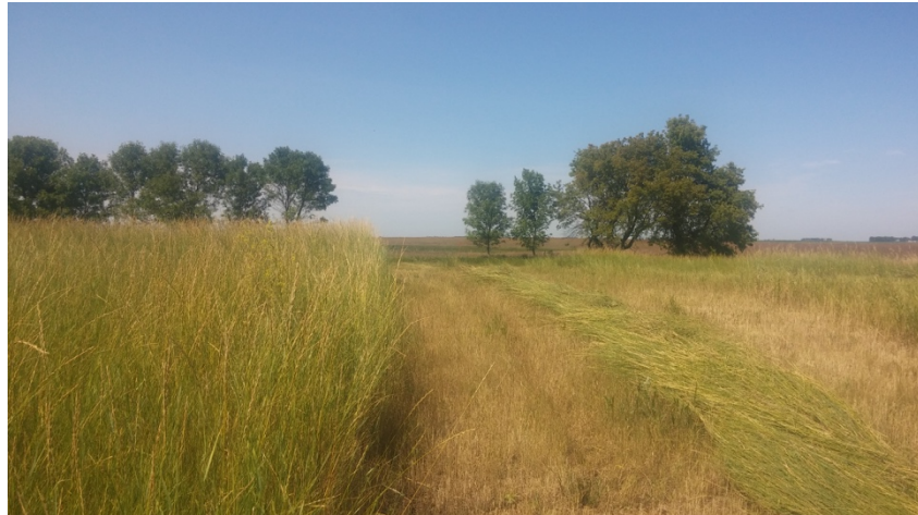
Kernza intermediate wheatgrass swathed and drying in a windrow in Madison, Minnesota. Note that stems are still green when cut.

Swathing: Swathing can be used to decrease shattering before grain harvest, and to dry down green biomass (including Kernza intermediate wheatgrass stems and weeds) for smoother combining. Optimal swathing time is earlier than optimal direct combining time. Grain can have a moisture content of