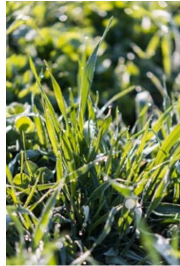
Spring forage from Kernza intermediate wheatgrass in Lancaster, Wisconsin.

After harvest, residue should be removed from the field as soon as possible. Residue should be swathed to near ground level, baled, and removed, since tall-standing stubble and straw left in the field can limit fall regrowth and subsequent yields. In some regions, burning can also be used to remove residue. However, burning straw in a heavy windrow or pile can generate enough heat to kill the plants below. Burning may allow more effective control of insects and diseases but harvesting the residue for use as forage is expected to be economically advantageous if the straw can be used for feed or bedding on-farm, or sold. Where organic straw is in high demand this could be an additional source of revenue for organic Kernza intermediate wheatgrass growers. As long as the residue was green at the time of harvest, it will be of higher feed value than wheat straw and may be good winter feed for beef cattle.