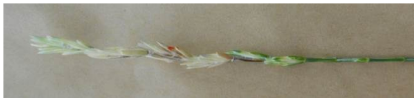
The red dot on this Kernza intermediate wheatgrass plant shows where scab infection was introduced.

Kernza intermediate wheatgrass is mildly susceptible to scab (fusarium head blight). Although dangerous levels are rare, its presence can generate toxins in the seed that make it unusable. Small samples can be examined by hand to identify the presence of any scabby kernels.