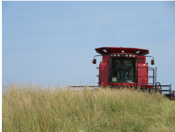
Combining Kernza intermediate wheatgrass in Lancaster, Wisconsin.

Direct Combining: Direct combining of the grain should only be considered if the stand is nearly weed-free. Green weeds in the stand can result in wet leafy material in the bin that will cause spoilage. Plants can be harvested when seed moisture reaches 35% or less. Usually, this condition requires a period of hot, dry weather, and harvest should probably not begin until morning dew has evaporated. Grain should be aerated immediately after