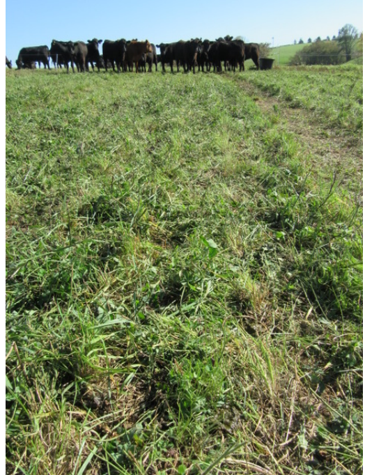
Management-intensive grazing is highly recommended on Kernza intermediate wheatgrass stands. A residual height of 6 inches is encouraged.

Management-intensive rotational grazing is advised on Kernza intermediate wheatgrass stands. However, if livestock are left on a particular portion of the field for more than a day or two, stand loss may occur (depending on how many animals are present). Continuous grazing should be avoided particularly in the spring, as livestock that graze too low can harm the developing seed heads. A residual height of 6 inches is recommended since overgrazing can weaken plants and decrease winter hardiness. Researchers are studying the effects of spring and fall grazing on subsequent grain yields. This information will be available to producers as soon as it is available.