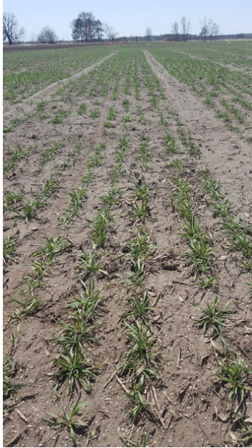
A first year stand of Kernza intermediate wheatgrass in early May. The stand was seeded in late August of the previous year.