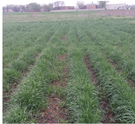
A second year stand of Kernza intermediate wheatgrass in late April, 2016. The stand was seeded in the fall of 2014.