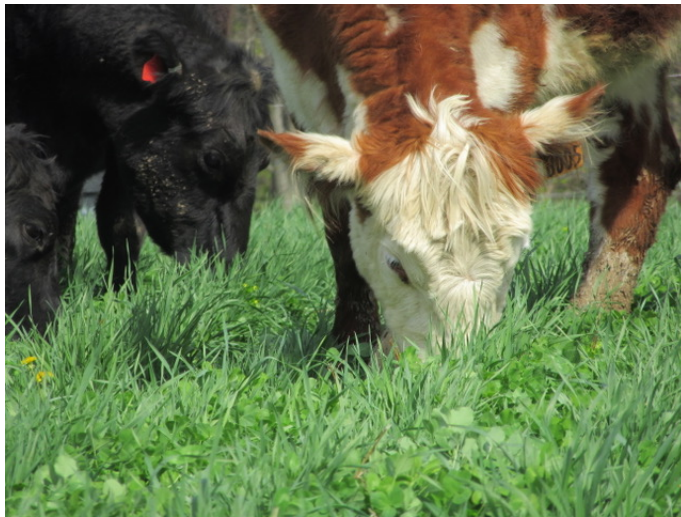
Beef cattle grazing on Kernza intermediate wheatgrass in Lancaster, Wisconsin in spring.

After grain harvest, Kernza intermediate wheatgrass begins vegetative regrowth similar to other perennial grass crops. This fall forage is high quality and can be fed to dairy cows or beef cattle.