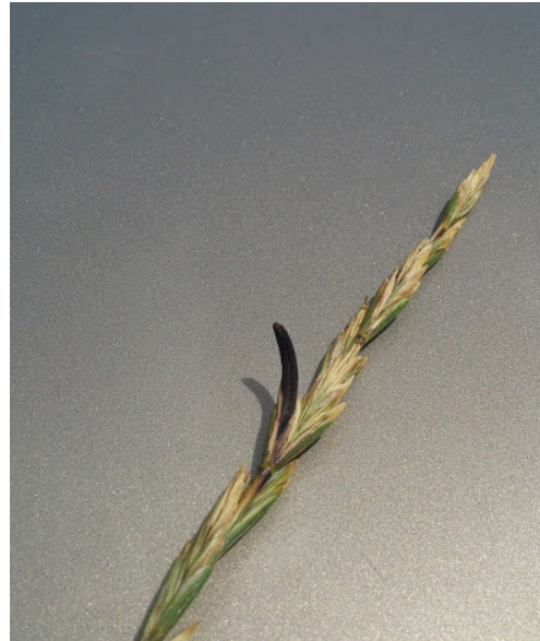
Kernza intermediate wheatgrass seed heads (or spikes) with ergot. Image: Jacob M. Jungers

Ergot is another disease of some concern. Infection is often greatest on upwind field edges that are not well pollinated. If ergot is observed in the field, avoid harvesting the infected areas along the field edge. Ergot contains toxins, and if present in harvested grain at dangerous levels, the black ergot bodies must be removed by cleaning. Note that some Kernza intermediate wheatgrass grains can be dark colored and potentially resemble ergot.