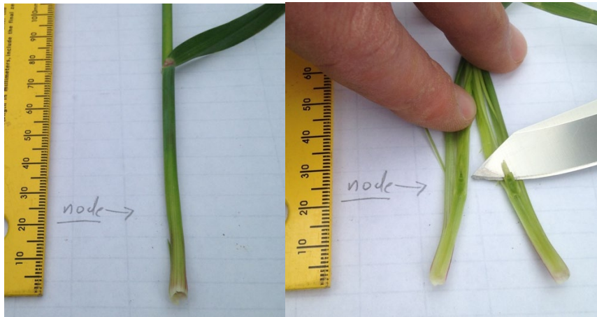
Kernza intermediate wheatgrass shoots at the start of elongation in spring. The node pictured is about 1 inch in height. Images: Steve Culman

increasing demand for energy during this period of rapid growth. The seed head will develop inside the stem and begin to swell when it is close to emerging (i.e., the boot stage). The seed head will emerge next, and flowers will open about two to three weeks later. The plants depend on wind for pollination. Seed development will typically occur in mid-July (although exact timing varies), and grain filling will take about three to four weeks before grain is mature, dry, and ready for harvest.