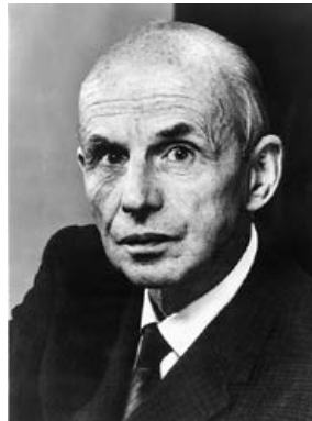
Hans Jenny saw destruction of a soil profile by machinery to cut timber or to build a museum as a sad loss. And for that sensibility he was glad.

library shelves. New findings by chemists, geologists, geneticists, and ecologists are regularly reported by the media, and commented upon, but the subject of soils seems to be taboo. I suspect that our intellectual isolation and our invisibility have to do with the lack of formulating exciting ideas about soils themselves and