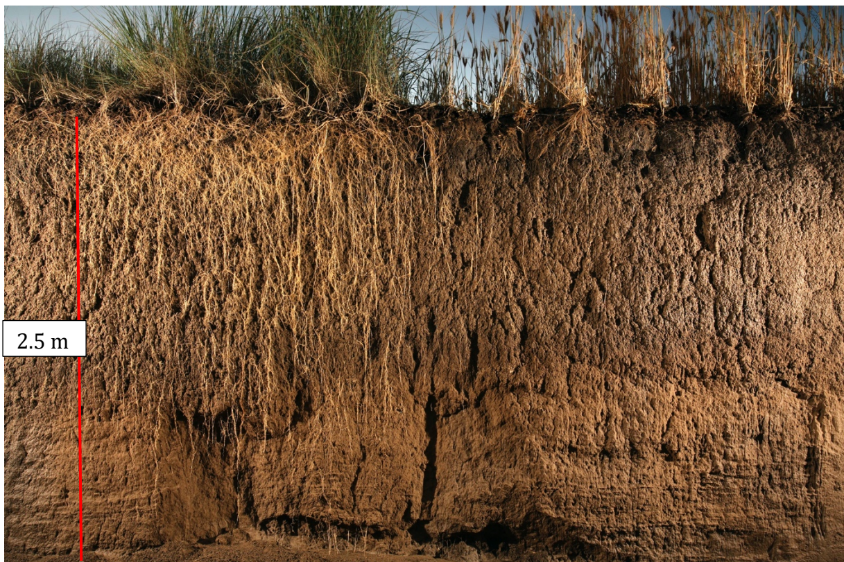
Figure 3. Comparison of root systems between the newly domesticated intermediate wheatgrass (left) and annual wheat (right). Intermediate wheatgrass produces the grain Kernza®.