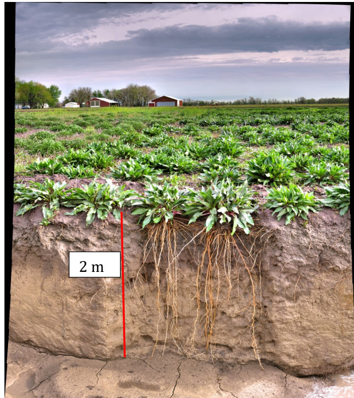
Figure 4. Deep roots of Silphium integrifolium . A native prairie species related to sunflower under domestication as a perennial oilseed crop.

Other perennial grain crops receiving attention include pigeon pea, barley, buckwheat, and maize (Batello et al. 2014; Chen et al. 2018) and a number of legume species (Schlautman et al. 2018). In most cases, the seed yields of perennial grain crops under development are well below those of elite modern grain varieties. In the time that it takes intensive breeding efforts to close the yield and other trait gaps between annual and perennial grains, perennial proto-crops may be used for purposes other than grain, including forage production (Ryan et al. 2018). Perennial rice stands out as a high-yielding exception, as its yields matched those of elite local varieties in the Yunnan Province for six growing seasons over three years (Huang et al. 2018).