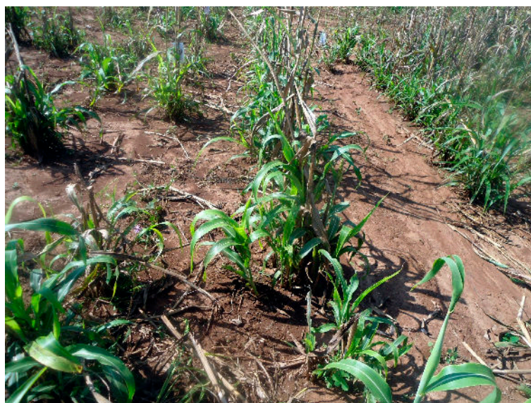
Figure 1. Post-harvest regrowth in a perennial sorghum trial at Serere, Uganda, 2015.

Starting in 2014–2015, many F_1 and F_2 plants with phenotypes very different from those observed in previous years began appearing in TLI nurseries. In previous experience, all F_1 hybrids and F_2 populations from annual \times perennial Sorghum crosses had phenotypes more similar to the perennial parent than to the S. bicolor parent: more profuse tillering and branching, longer panicle branches, thinner culms, greater height, smaller seed, and more tenacious glumes. In contrast, the new, anomalous hybrid plants (comprising 129 of the 165 interploidy hybrids produced in 2013) were closer in phenotype to S. bicolor . Further investigation showed that all of the 129 anomalous hybrids were not tetraploid as would be expected, but were in fact diploid [23]. Only a single such diploid product of diploid \times tetraploid Sorghum hybridization had been reported previously [24]. The timing and mechanism of chromosome elimination that leads to such hybrids is still under investigation; nevertheless, if perennial diploid plants can be selected from S. bicolor n \times S. halepense populations, complications of interploid hybridization and tetraploid segregation can be avoided, thereby streamlining perennial sorghum development.